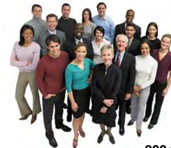
200+ OK-CAN Members